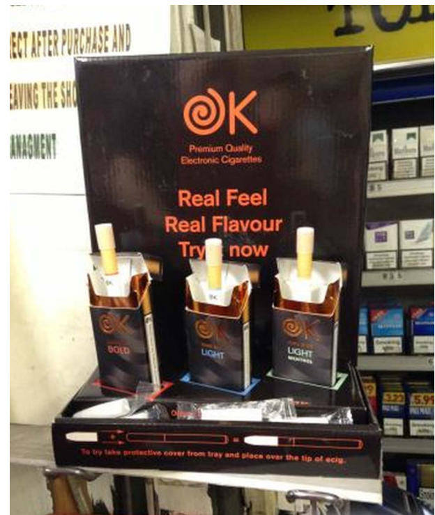
Figure 1 Point-of-sale movable display that invites store customers to sample the e-cigarette by providing disposable plastic covers to put over the tip.

Our audit tool included dichotomous measures for whether stores sold e-cigarettes, promoted them with