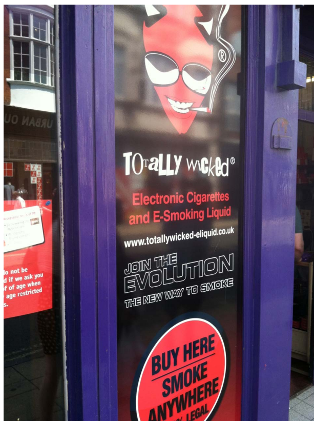
Figure 2 An example of an exterior e-cigarette advertisement.