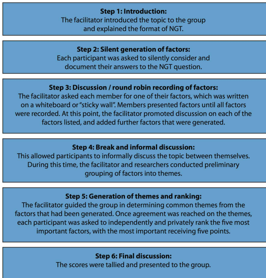
Figure 2 Process of nominal group technique (NGT).